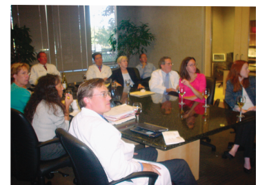
CEI and LTHF staff meet monthly to research case studies.

A patient hit by lightning 16 years ago has been deaf since. Implanted with Bilateral Cochlear implants at CEI / LTHF, she has had her hearing returned! This is the first such patient to our knowledge in the world and this report details her case.